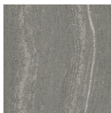
Forge Platinum 33518