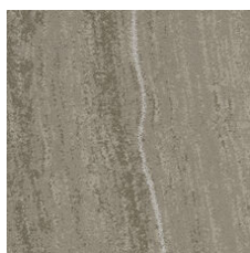
Element Platinum 33506